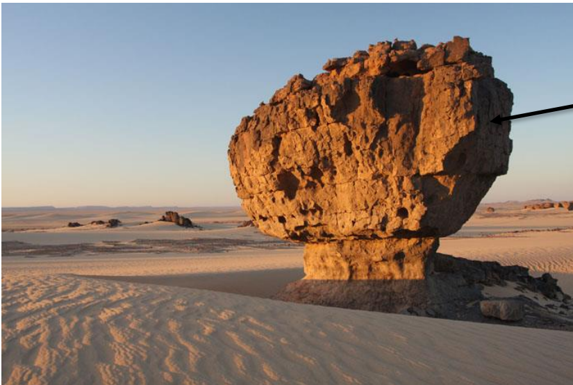
Fig. 3 - Dryland landscape in Algeria