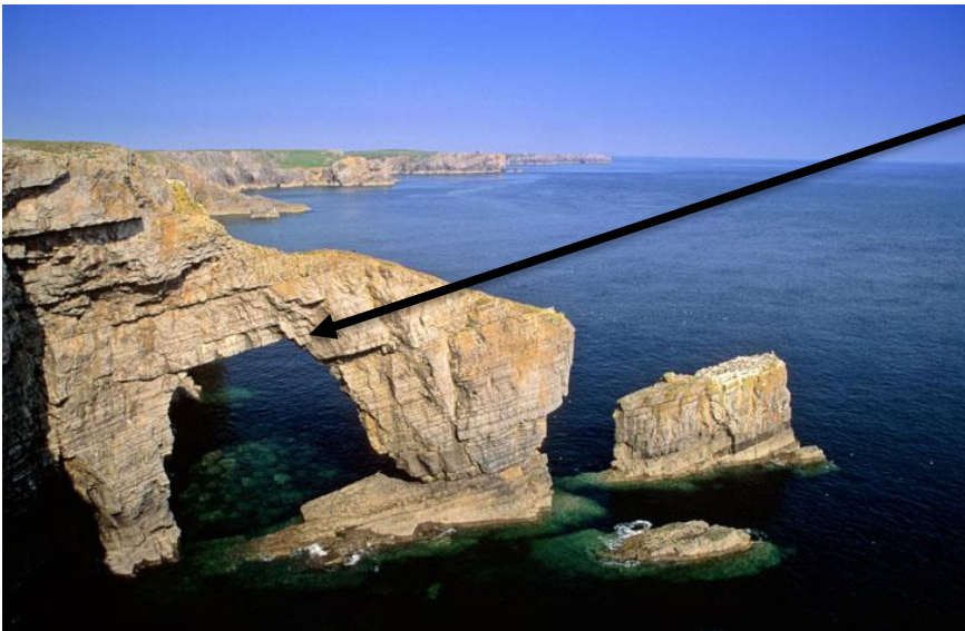
Fig. 1 - Coastal landscape in the United Kingdom