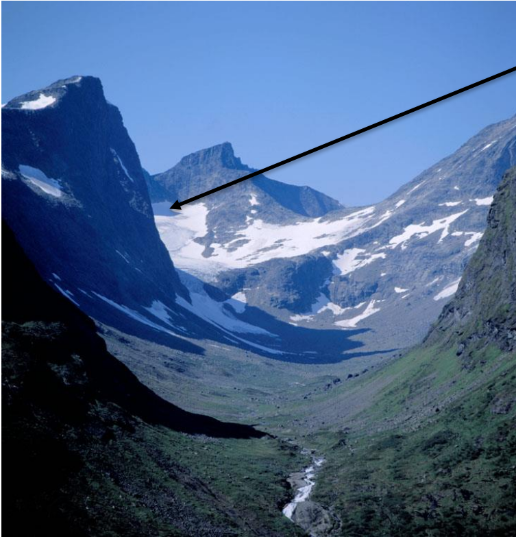
Fig. 2 - Glaciated landscape in Norway