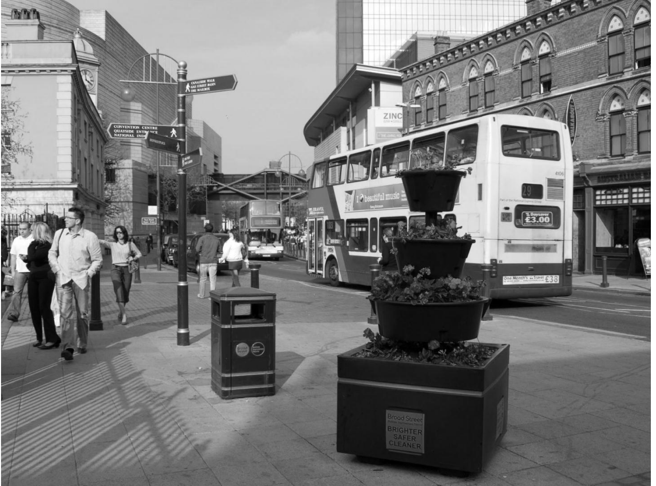
Birmingham city centre