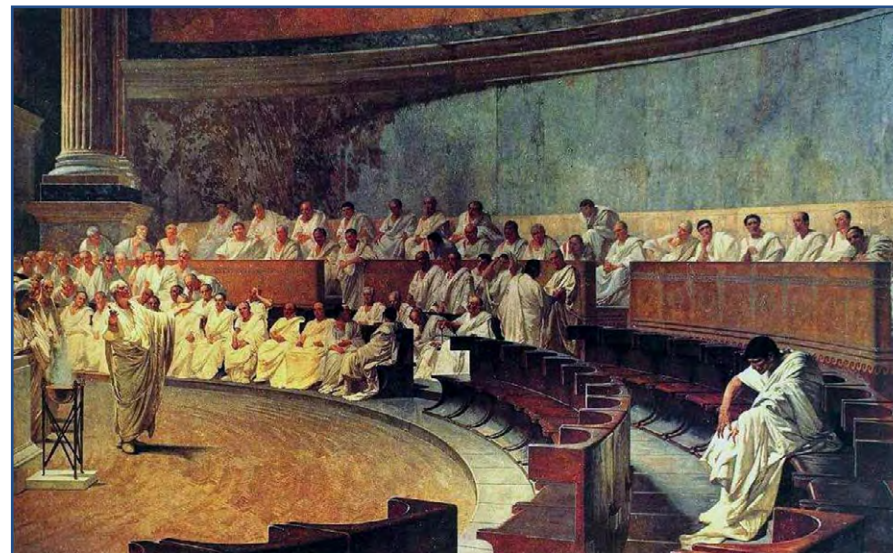
Cicero Denounces Catiline, painting by Cesare Maccari.

Explore an accessible and practical guide to the key points of Cicero's education in rhetoric, closely based on Cicero's own reports