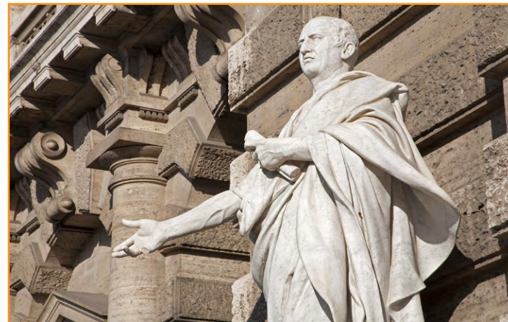
Rome - statue of Cicero from facade of Palazzo di Giustizia.

Cicero winds up his case with an emotional appeal. Cicero points out that he himself weeps as he speaks to defend Milo, and will have to cease speaking because of his tears. "If this city expels Milo, it will be acting ungratefully - and the city that receives him (as he goes into exile) will be just," he states, before flattering the judges once more.