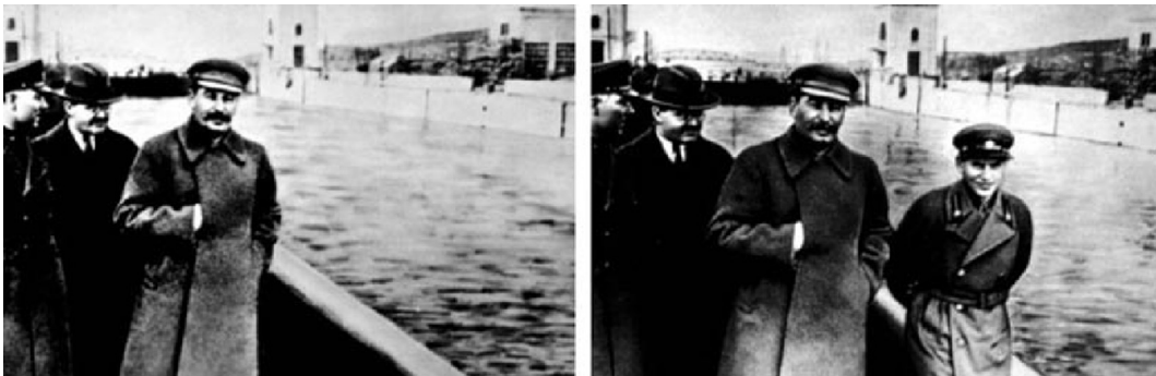
One of Stalin's enemies removed from a photo around 1930.