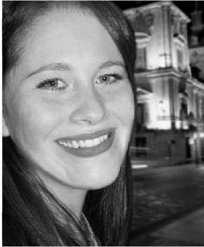
Photoshopped: friend replaced with glamorous building, double chin removed and lips darkened.