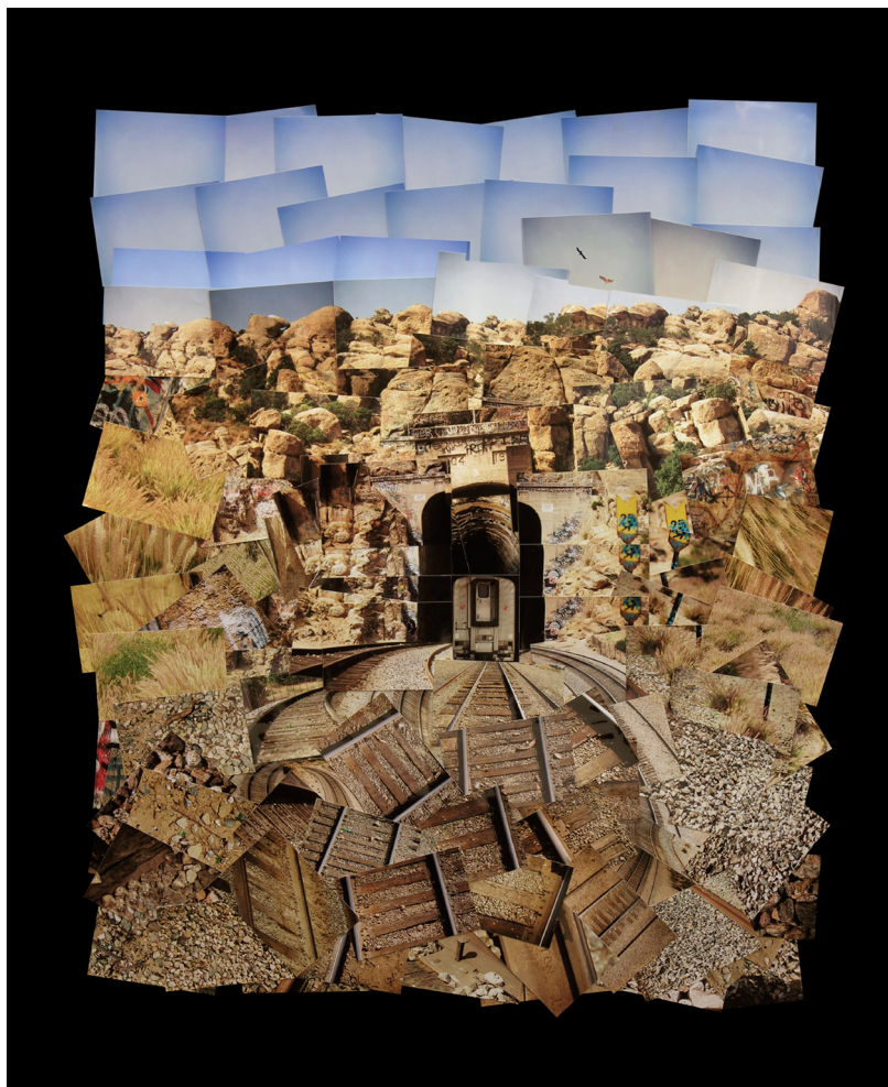
'Joiners' inspired by Hockney