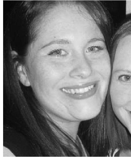
Original holiday photograph.