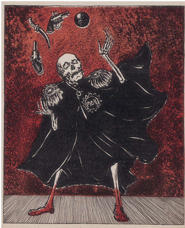
From the cover of a Russian political magazine published in 1906. The figure represents the Tsar. His rosette refers to 1905–6.