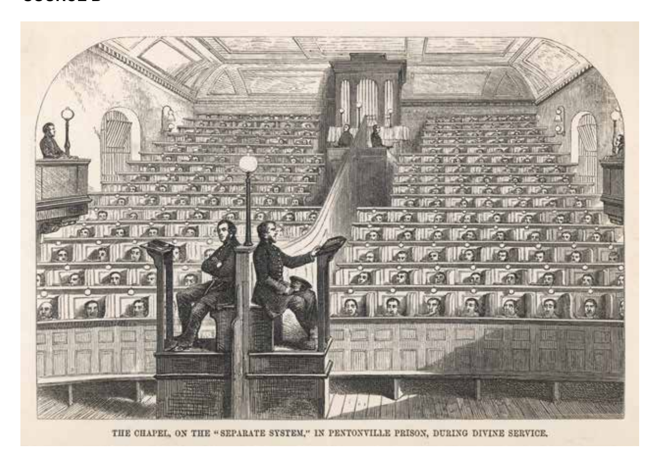
A drawing of prisoners in the chapel of a prison in London, 1862.