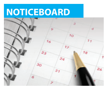
15 Diary dates with OCR