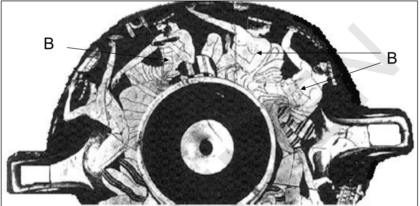
Cup by the Tarquinia Painter

Study the picture and then answer all the questions that follow.