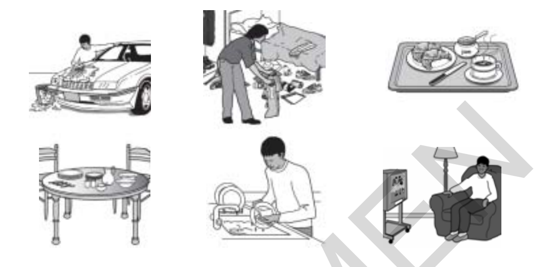
Part 2 Questions 6-10 My Home