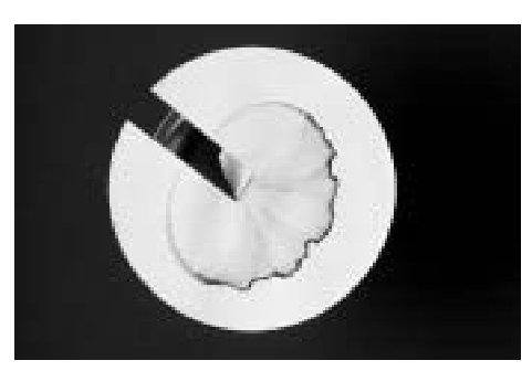
This method shows the colours in the ink used to write the cheque.

Numbers and words can be added to make it worth more