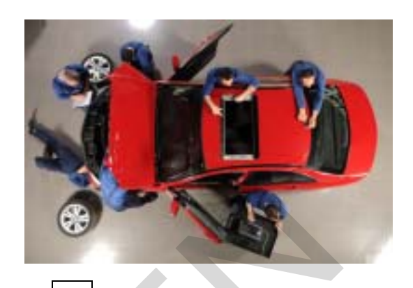
Workers at the MDZ car factory work on a single car until they have finished it.