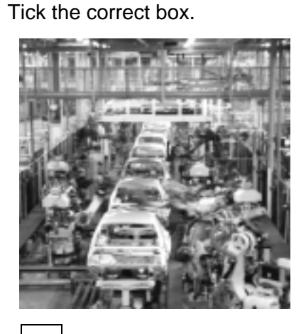
At Zog Cars, hundreds of cars are made at the same time.

4 (a) Which one of these statements is about mass production?