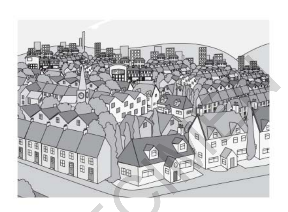
Part 1 Questions 1-5 In town