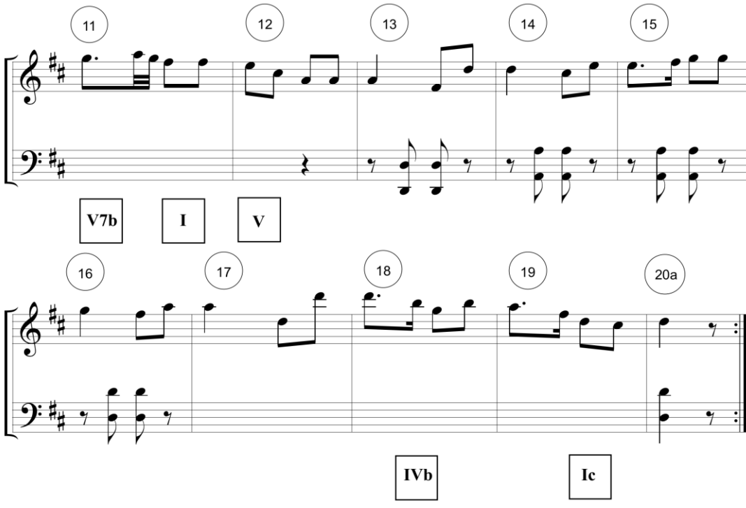
Award 1 mark for each chord positioned accurately

On the score indicate where these chords occur by writing in the boxes provided.