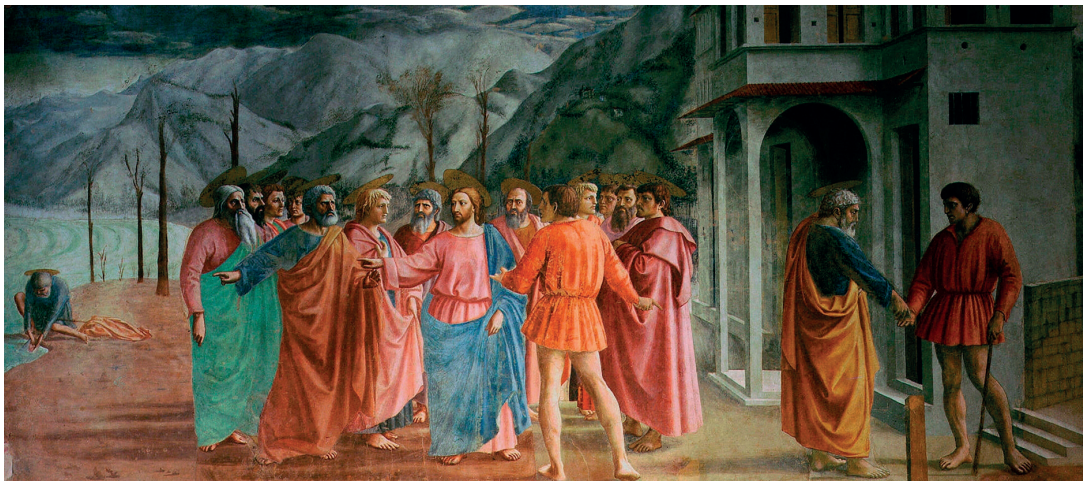
Masaccio's 'The Tribute Money', 1427. This fresco is in a church in Florence. It depicts a Roman tax collector demanding money from Christ and his apostles.

Source 1: An early Renaissance painting.