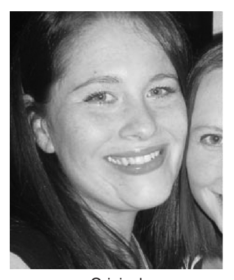
Original holiday photograph.