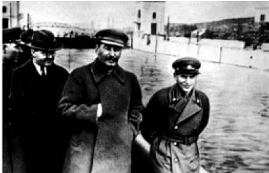
One of Stalin's enemies removed from a photo around 1930.