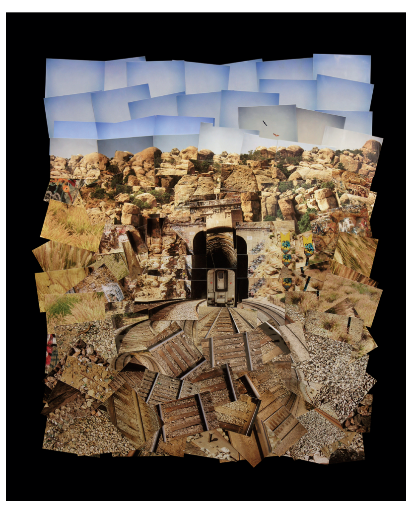
'Joiners' inspired by Hockney