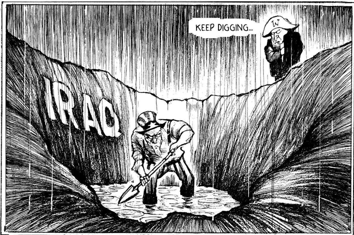
The Plan for Victory

A cartoon published in the USA in November 2005. The man in the hole is Uncle Sam, who represents the USA. The man shouting instructions is President George W. Bush.