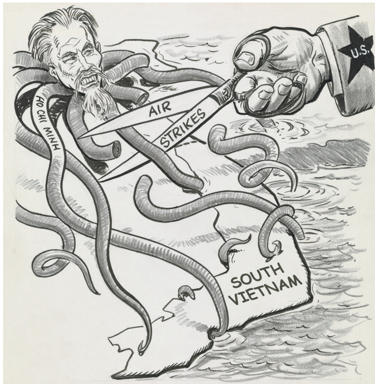
A cartoon published in the USA in April 1965.