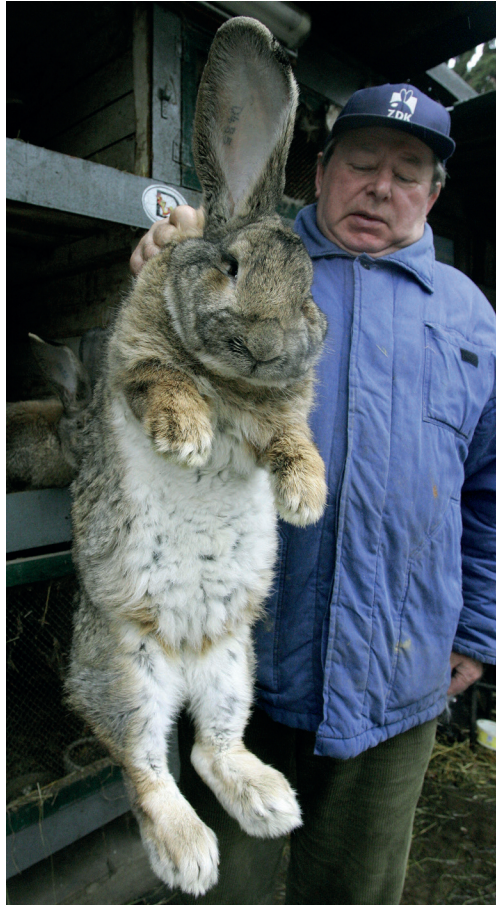
Photograph of a giant rabbit

Adapted from J Owen, 'Monster Rabbit Stalks U.K. Village (But No Sign of Wallace or Gromit)', 11 April 2006, www.news.nationalgeographic.com , National Geographic News. Item removed due to third party copyright restrictions.