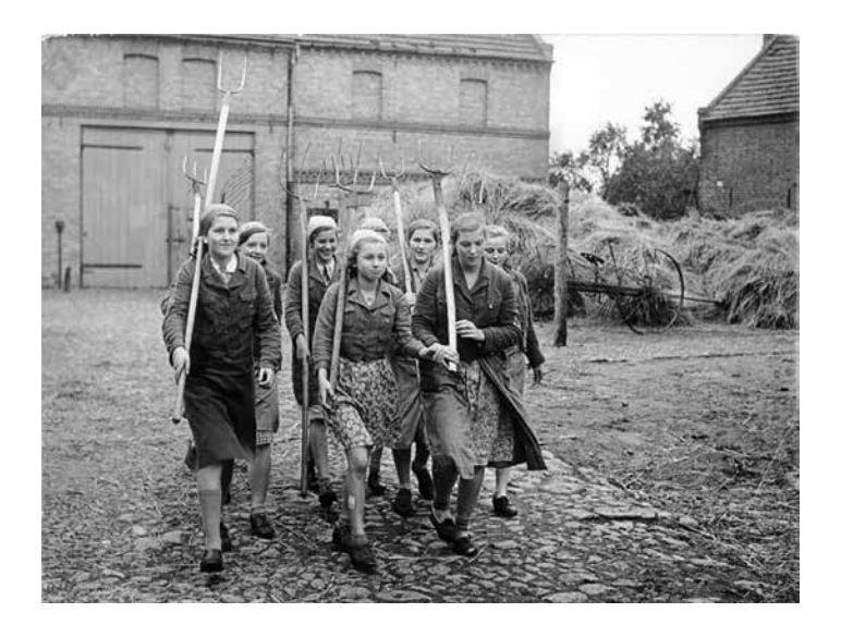
A photograph published in a Nazi magazine, May 1942. The caption to the photograph read 'Bringing all the enthusiasm and life force of their youth, our young daughters of the Work Service make their contribution.'