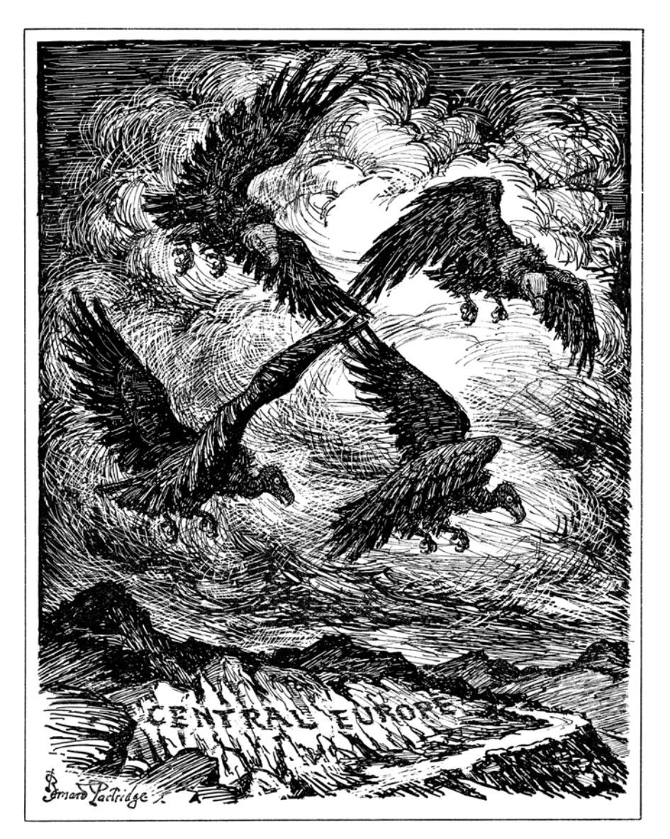
THE GATHERING OF THE VULTURES

A cartoon published in Britain on 22 March 1939.