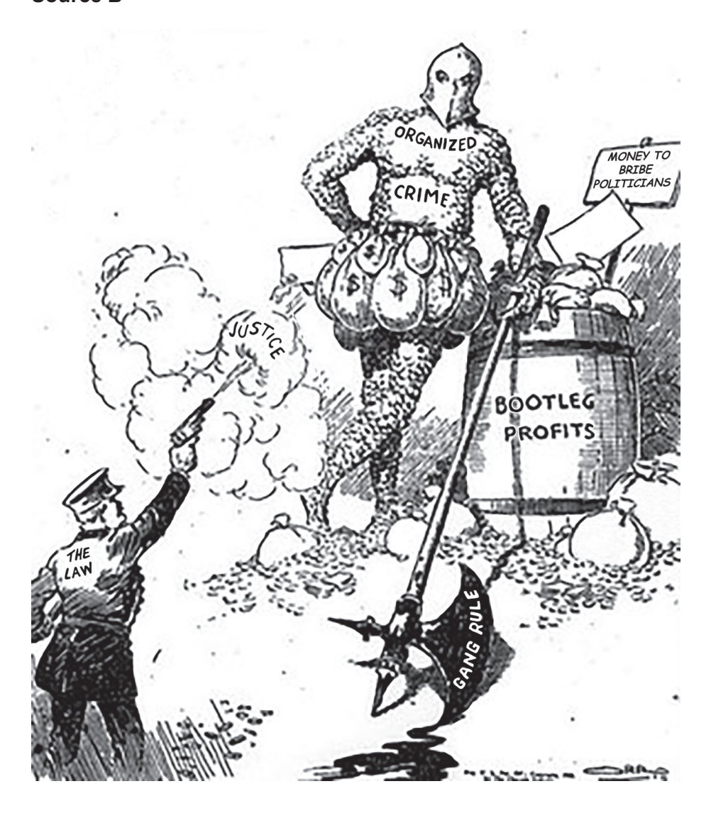
A cartoon published in 1926 in The Chicago Tribune (a US newspaper).

5* 'The New Deal had achieved its aims by 1939.' How far do you agree?