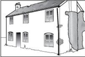
Fig. 1 A derelict building